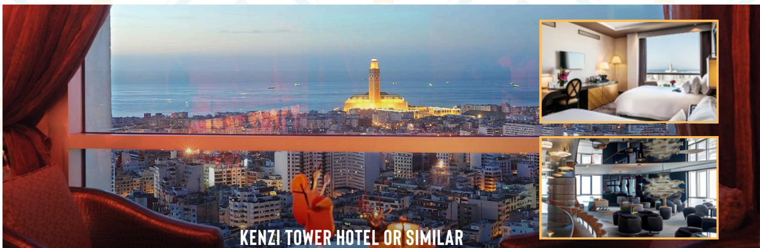
KENZI TOWER HOTEL OR SIMILAR