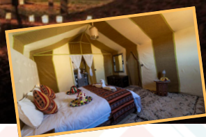
SAHARA DESERT LUXURY CAMP OR SIMILAR