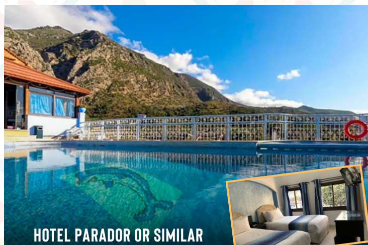
HOTEL PARADOR OR SIMILAR