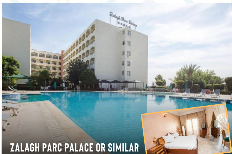
ZALAGH PARC PALACE OR SIMILAR