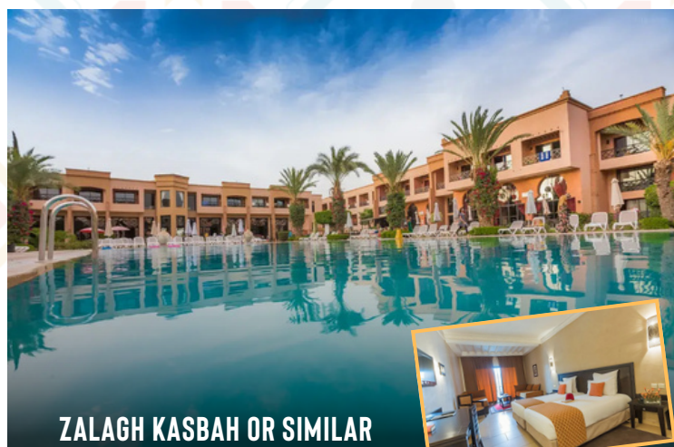
ZALAGH KASBAH OR SIMILAR