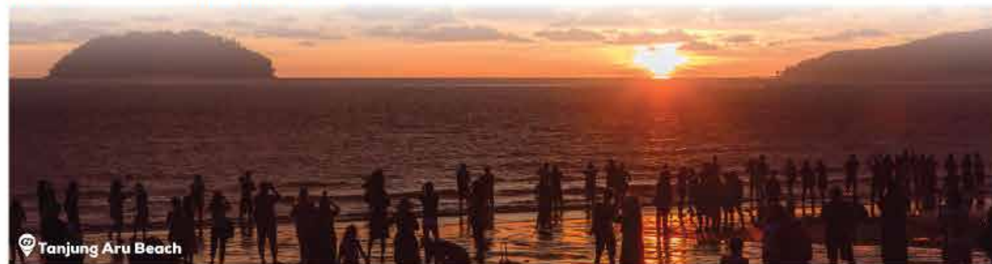
Tanjung Aru Beach