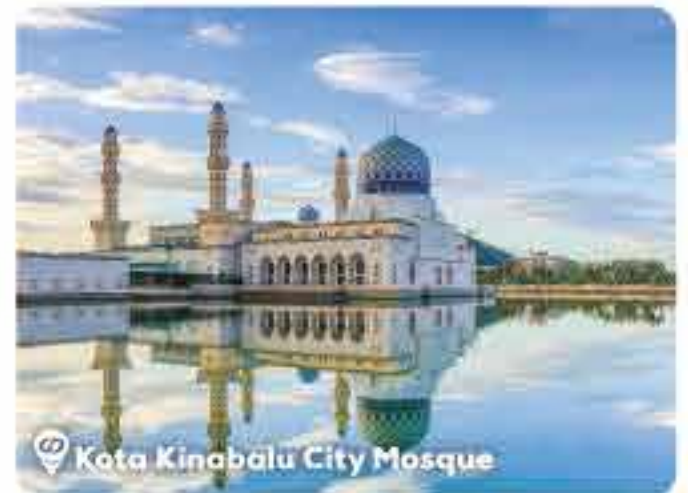
Kota Kinabalu City Mosque