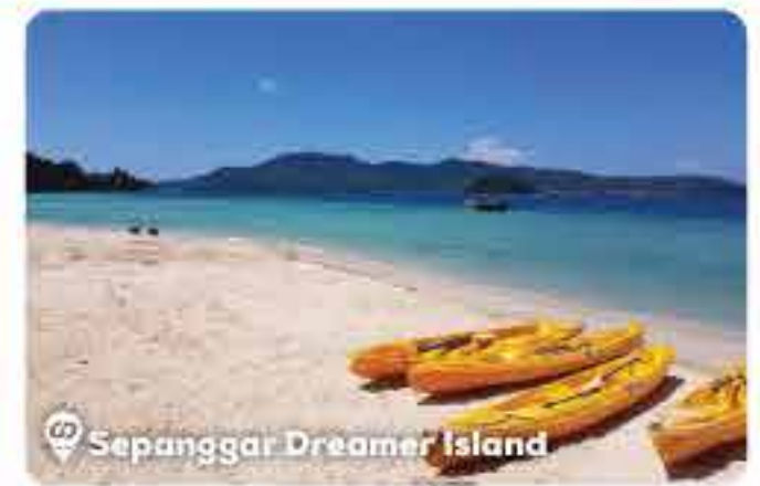
Sepanggar Dreamer Island