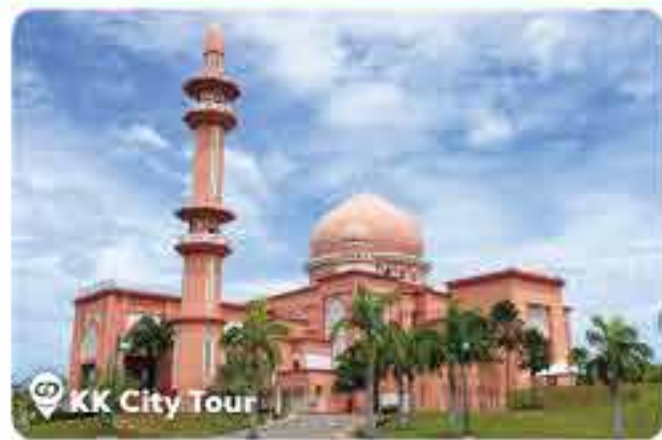
KK City Tour