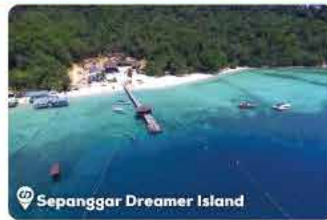
Sepanggar Dreamer Island