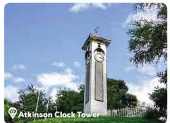
Atkinson Clock Tower