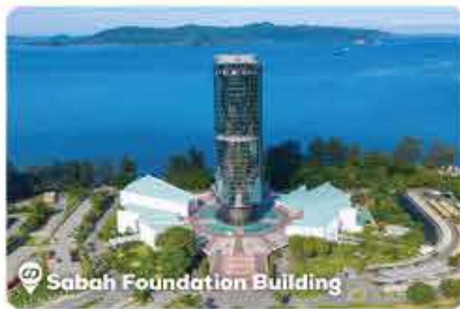
Sabah Foundation Building