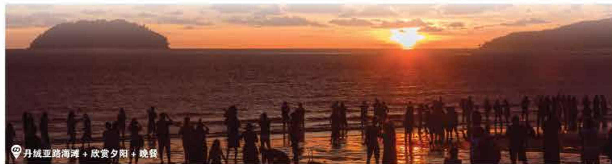
丹绒亚路海滩 + 欣赏夕阳 + 晚餐