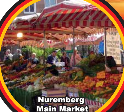
Nuremberg Main Market