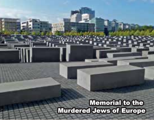
Memorial to the Murdered Jews of Europe