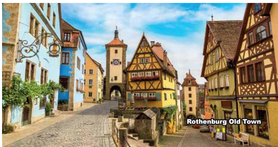
Rothenburg Old Town

Remark: There will be no refund or replacement if the tour logistic affected by the above issue. All pictures are for illustration purpose only