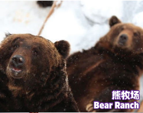
熊牧场 Bear Ranch