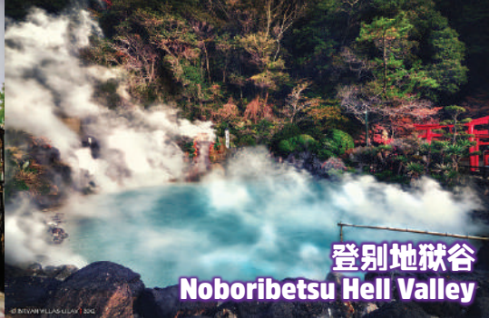
登别地狱谷 Noboribetsu Hell Valley