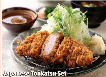
Japanese Tonkatsu Set