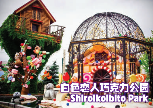
白色恋人巧克力公园 Shiroikoibito Park