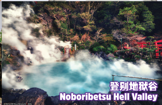
登别地狱谷 Noboribetsu Hell Valley