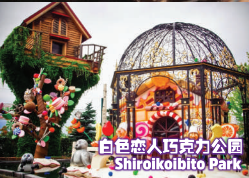
白色恋人巧克力公园 Shiroikoibito Park