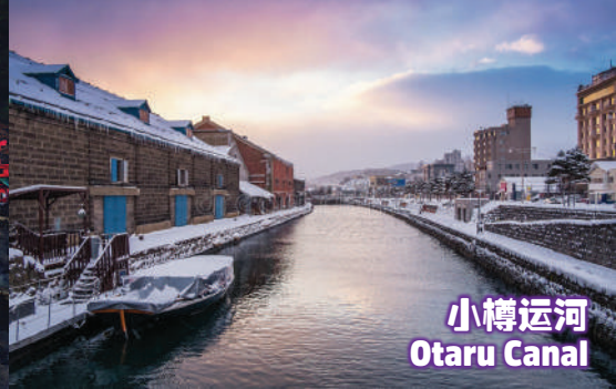
小樽运河 Otaru Canal