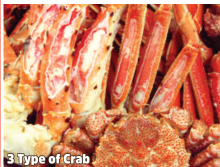
3 Type of Crab