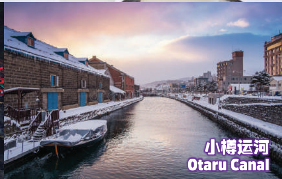
小樽运河 Otaru Canal