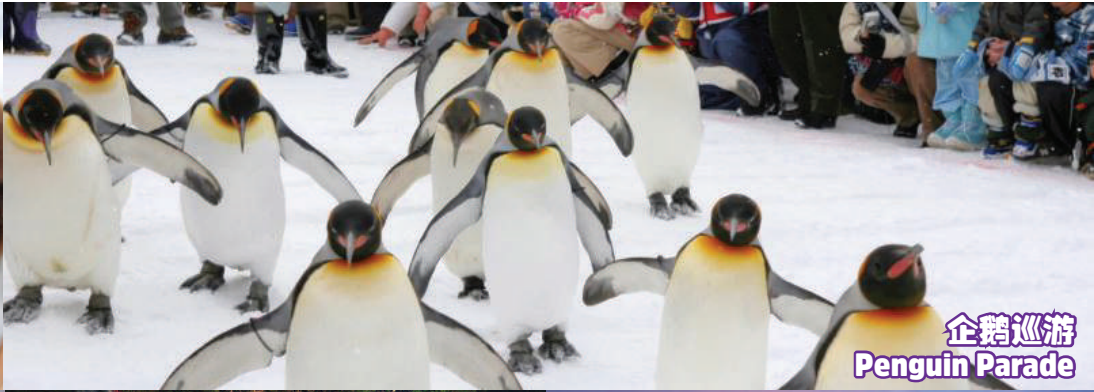
企鵝巡游 Penguin Parade