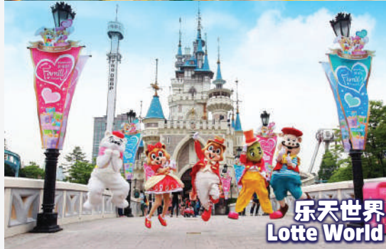
乐天世界 Lotte World