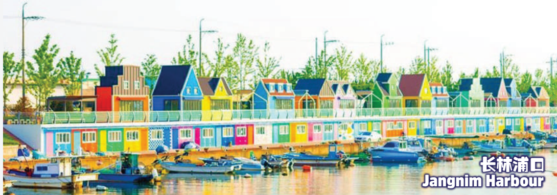
长林浦口 Jangnim Harbour