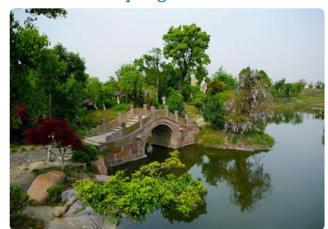
Xiaozhou Village of Guangzhou