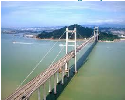
Humen Pearl River Bridge