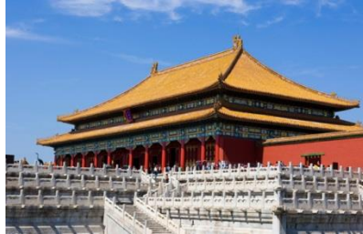
THE FORBIDDEN CITY