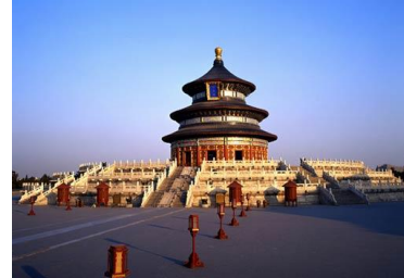
THE TEMPLE OF HEAVEN