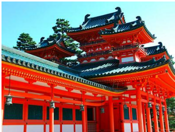
Heian Jingu Shrine

Start the day with a train ride from Osaka to Kyoto, Japan's capital from 794 to 1868. Visit Nijo Castle, the residence of Tokugawa era shoguns, and marvel at the gold-leaf covered Golden Pavilion, which houses sacred relics of Buddha. Stroll through its surrounding garden, known for its exquisite beauty. Visit Kyoto Imperial Palace and have lunch at Kyoto Nagomikan. Walk through Sanjusangendo Temple, Japan's longest wooden structure, and browse through the specialty shops leading up to Kiyomizudera Temple for a sweeping view of the city. Visit Heian Jingu Shrine, a partial replica of the Imperial Palace.